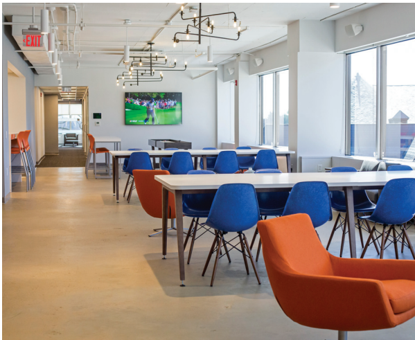
HFF Corporate Office, Morristown, NJ

Prior to relocating to Morristown, HFF reached out to PSA to design a new office that would create a balanced work environment for the company's two practice groups. Leveraging the great views of the Morristown Green, PSA's design utilized glass office fronts to provide natural light throughout the entire space. Centered between the two practice groups is a thoughtfully designed common area that promotes an environment of serious teamwork and casual relaxation. The furniture and finish selections complement HFF's brand, including the design of a custom shuffleboard table. The completed project is a beautiful, well-balanced space that is operationally effective and collaborative.